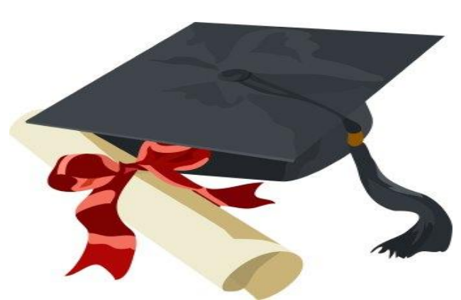
Congratulation to our 2016 St. Paul's Graduates

We celebrate with our youth who recently graduated from Columbian High School: